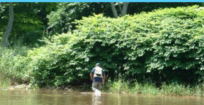
A KNOTWEED MONOCULTURE

The shallow root system fails to hold back dirt in times of erosion and flooding, resulting in scoured and unstable stream banks.